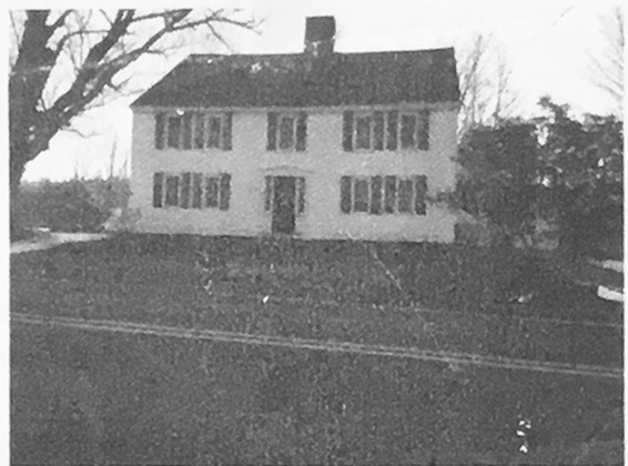
Rapalyea House, 70 Franklin Road, NH Route 127.